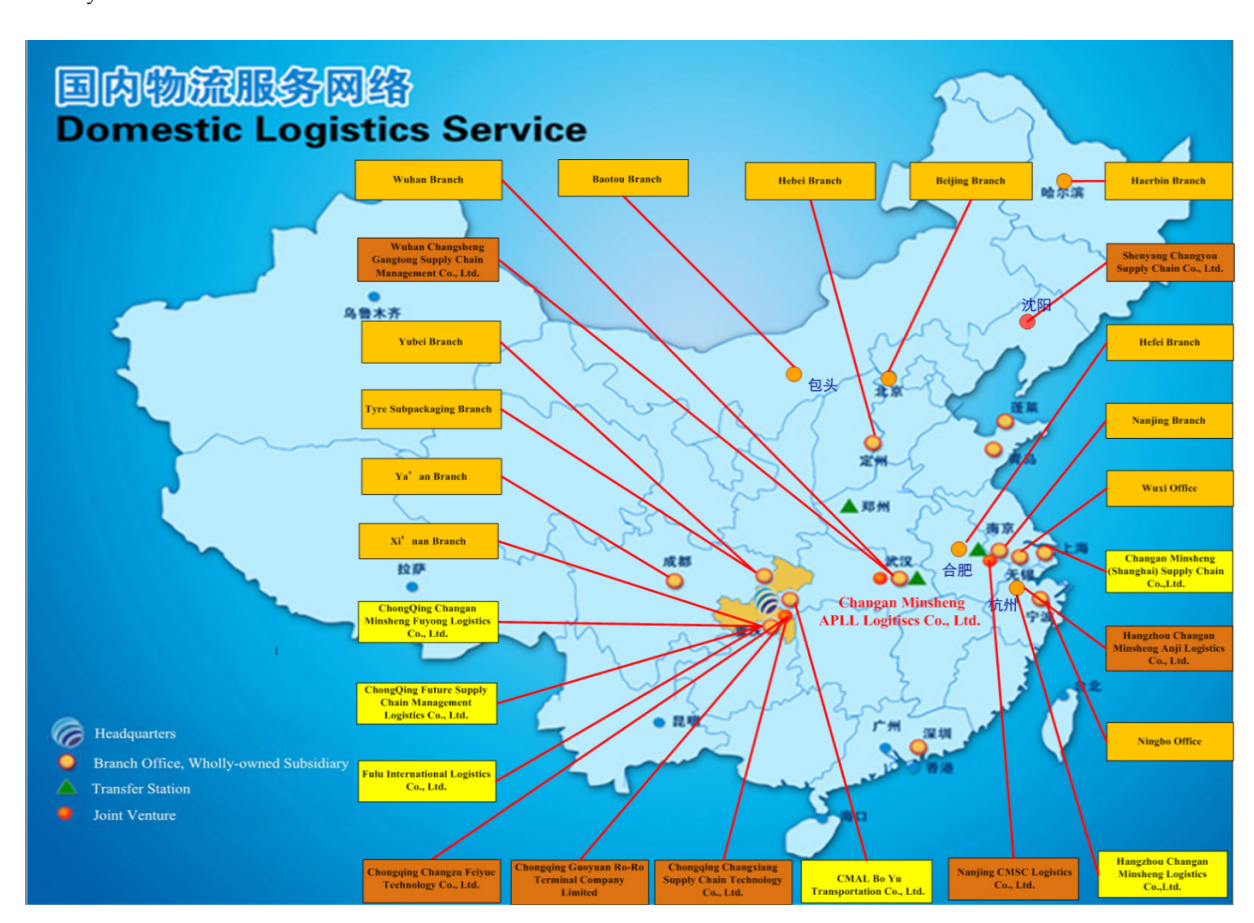
Picture 2: Location of the Company's existing branches, subsidiaries and representative offices

As at 31 December 2020, the Company had a total of 26 branches, subsidiaries, associated companies and representative offices, which are mainly located in East China, Central China, North China, South China and Southwest China (Picture 2). The continuous enhancement of service network enables the Group to provide logistics services to different parts of the country.