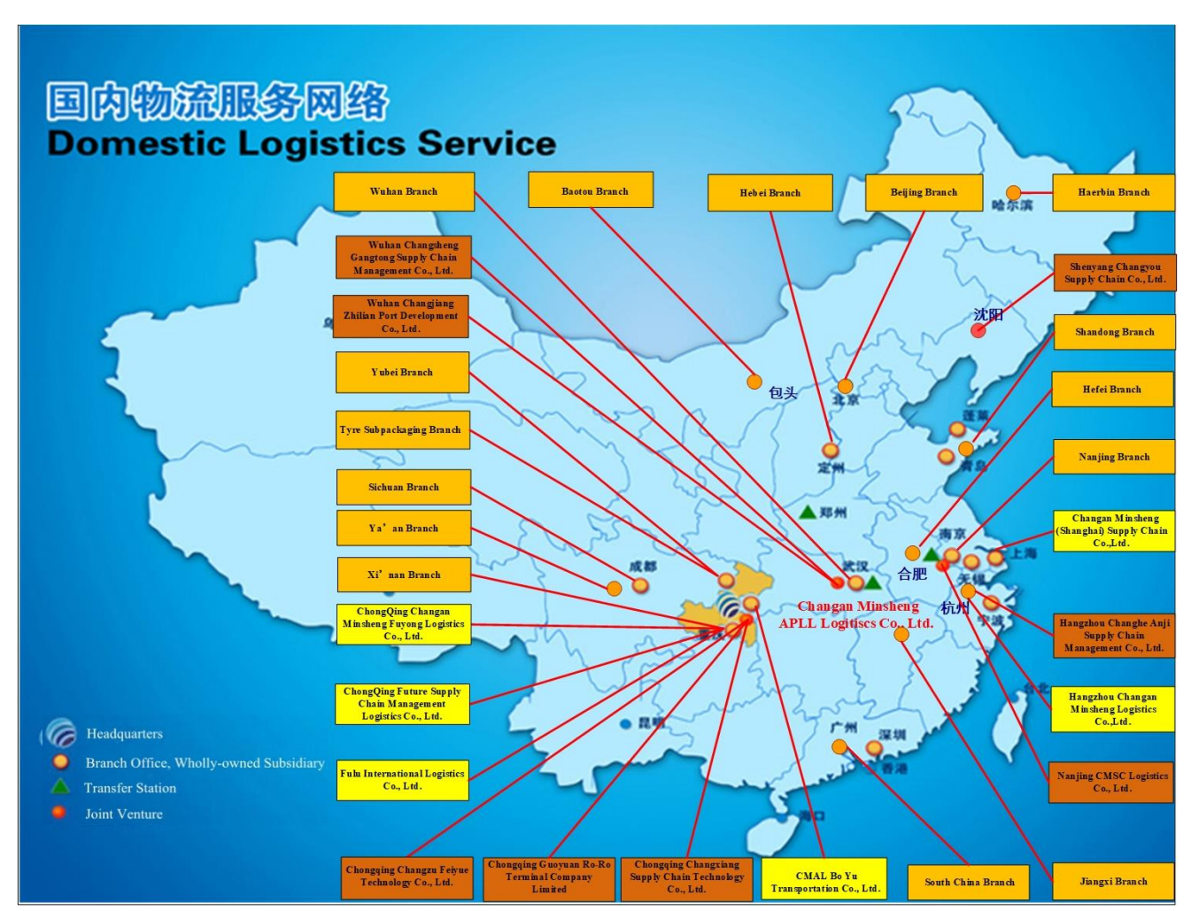
Picture 2: Location of the Company's existing branches, subsidiaries, associated compaies and representative offices

As at 31 December 2022, the Company had a total of 29 branches, subsidiaries, associated companies and representative offices, which are mainly located in East China, Central China, North China, South China and Southwest China (Picture 2). The continuous enhancement of service network enables the Group to provide logistics services to different parts of the country.