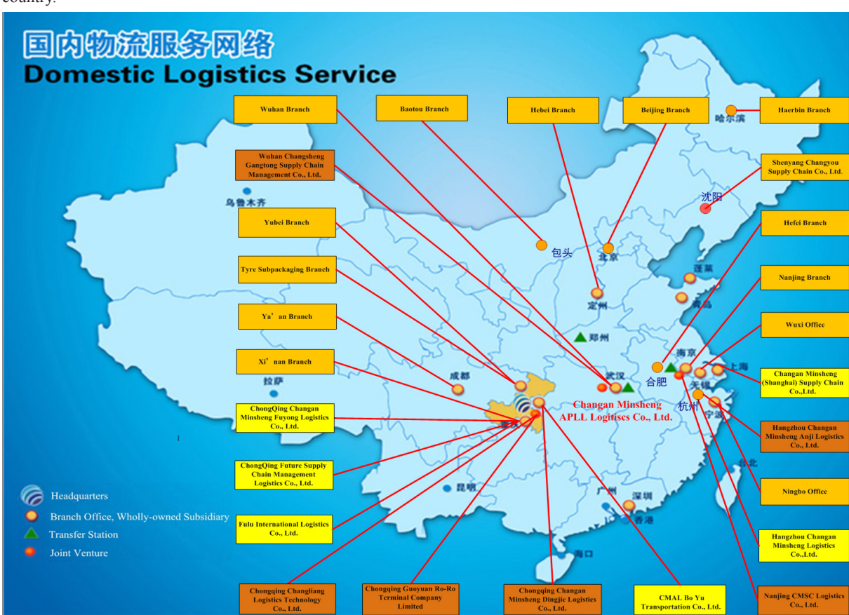
Picture 2: Location of the Company's existing branches, subsidiaries and representative offices

As at 31 December 2019, the Company had a total of 26 branches, subsidiaries, associated companies and representative offices, which are mainly located in East China, Central China, North China, South China and Southwest China (Picture 2). The continuous enhancement of service network enables the Group to provide logistics services to different parts of the country.