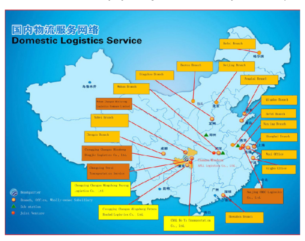
Chart 2: Location of the Company's existing branches, subsidiaries and representative offices

In order to broaden its services network and enhance its services capability, the Company strengthened the infrastructure of its branches by better utilising the information technology system and managing them in a more scientific way. As at 31 December 2012, the Company had a total of 22 branches, subsidiaries, associated companies and representative offices, which are mainly located in East China, Central China, North China, South China and Southwest China (Chart 2). The continuous enhancement of service network enables the Group to provide logistics services to different parts of the country.